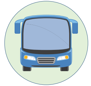
Public transit workers

You may choose from Moderna, Pfizer or J&J for your booster dose