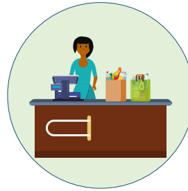
Grocery store workers