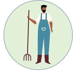
Food and agriculture workers